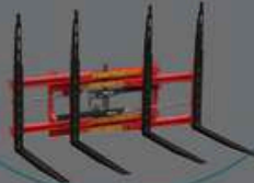
MULTI PALLET HANDLER