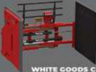
WHITE GOODS CLAMPS