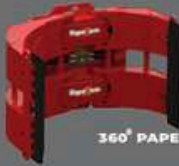
360° PAPER ROLL CLAMPS