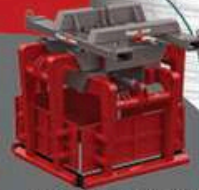
FOUR SIDED KEYSTONE CLAMPS