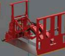
PUSH PULL ATTACHMENTS